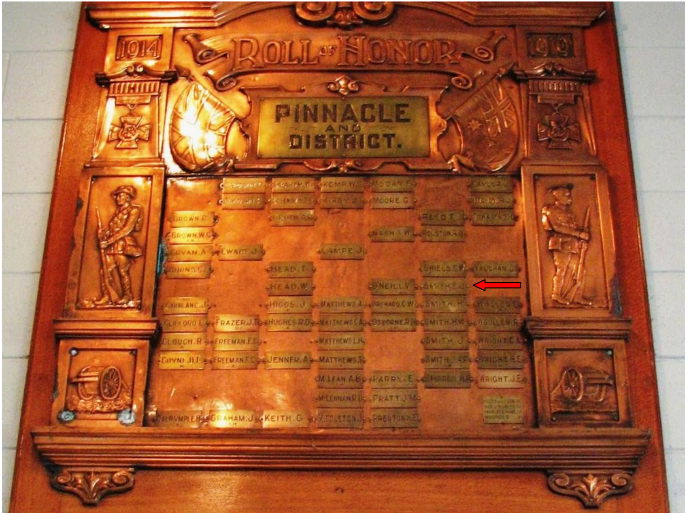
Pinnacle and District Roll of Honour