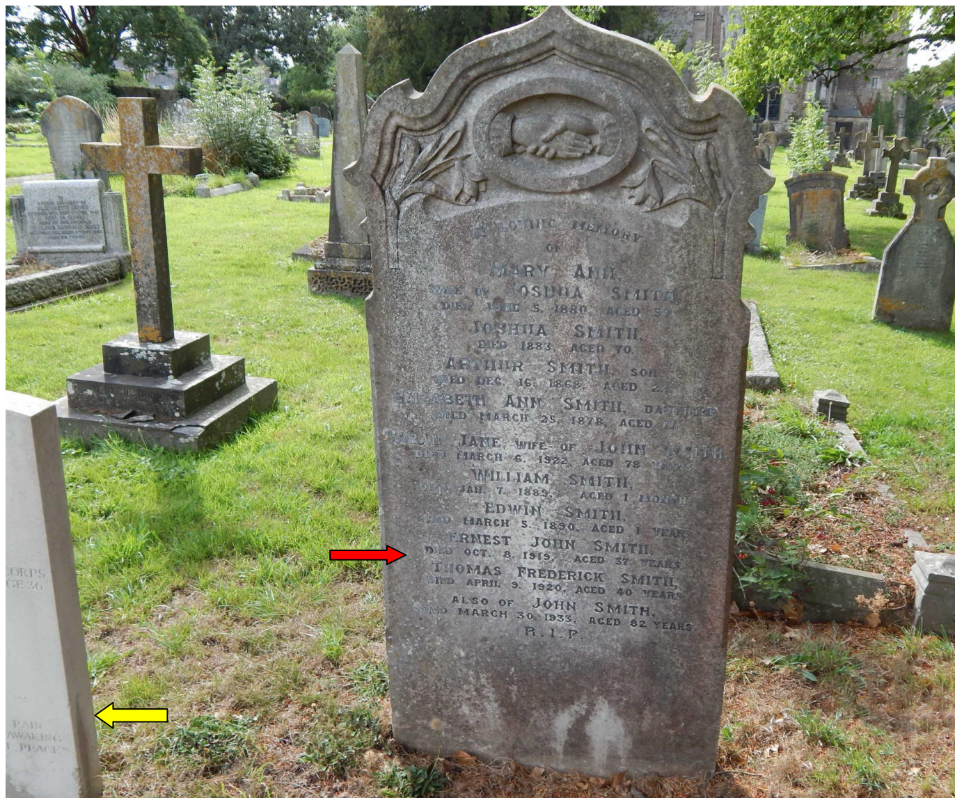
Smith Family Headstone in St. Mary's Churchyard, Bruton