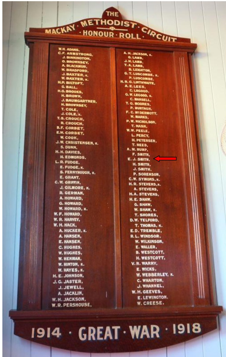
Mackay Methodist Circuit Honour Roll