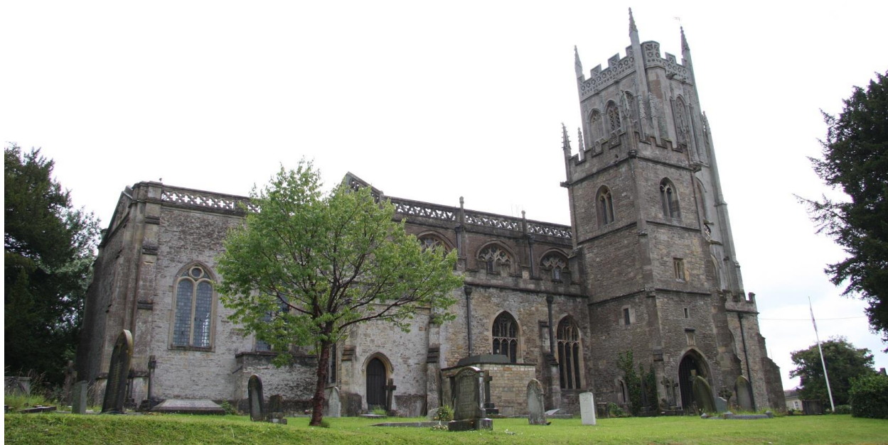
St. Mary's Church & Churchyard

St. Mary's Churchyard, Bruton contains 4 Commonwealth War Graves – 2 from World War 1 & 2 from World War 2.